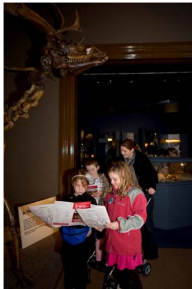
A family enjoys The Manx Museum Discovery Trail