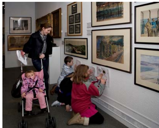
Children try to find the answers in The Manx Museum Art Gallery